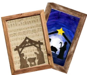
Monday December 8th