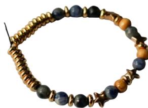
Monday December 15th